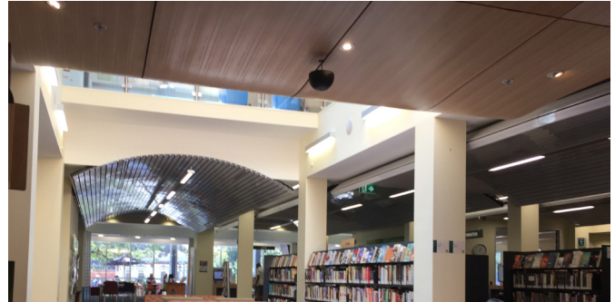
Reflective surfaces in the library complicated the acoustic design