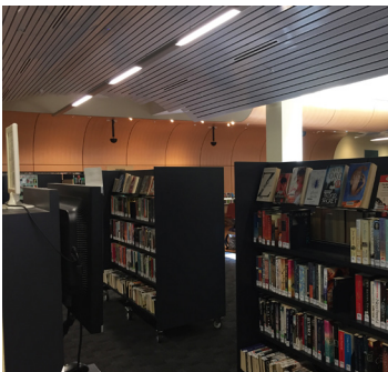
Pressed aluminium ceiling required expert