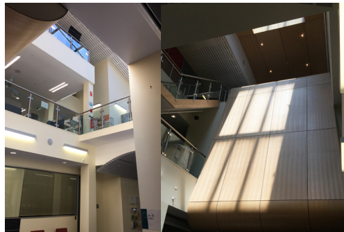
The atrium – noise transfer was exacerbated by the wooden facade