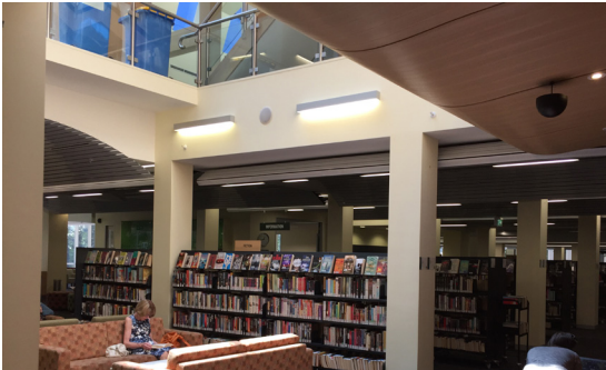
Cut in and hung transducers used to fill the atrium