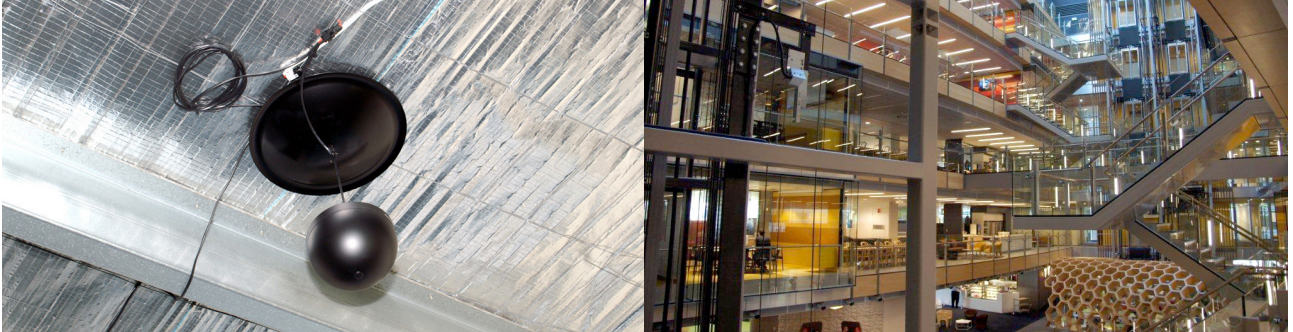
One of the 2000 transducers installed with acoustic discs