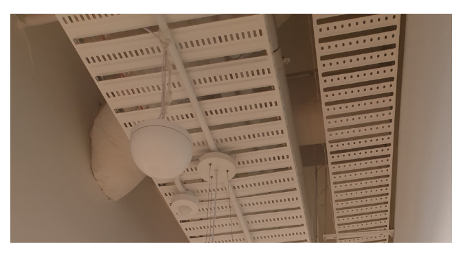
Transducer in communal hallway integrates discretely