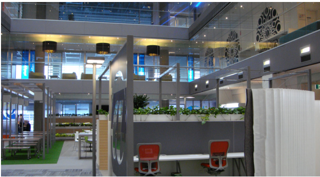
Open plan atrium spans several areas