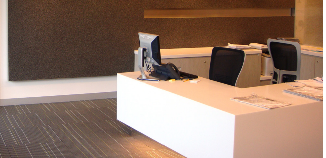
Reception area required speech privacy