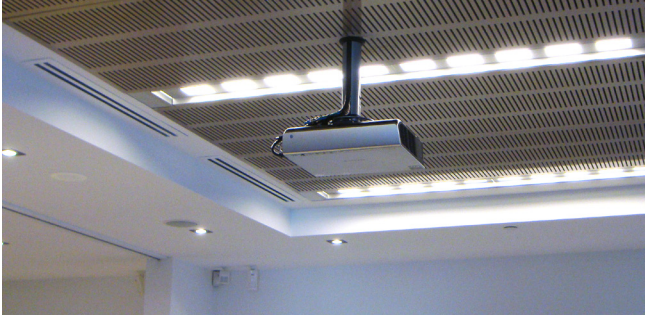
Conference area ceiling materials