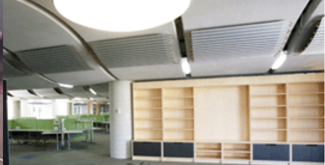
The "green" ceiling necessitated an under floor installation