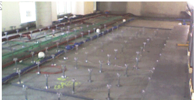
Soundmask installation laid out prior to floor installation

The CH2 "world's greenest office" building was so quiet that it required the introduction of an under floor Soundmask system. The services, including Soundmask's transducers are installed under the Tasman Access floor, as there are no suspended ceilings. This floor was manufactured from steel and concrete composite, requiring powerful transducers to ensure the correct penetration of sound.