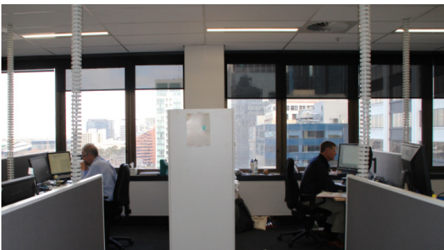
Open plan office area