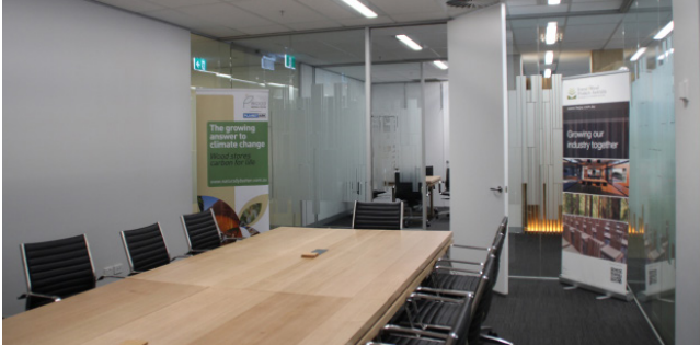
Board room with reflective glass surfaces