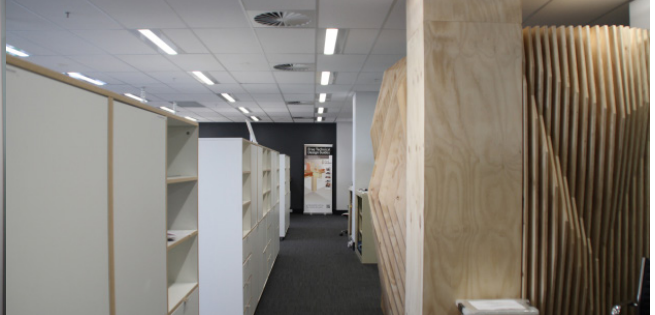
Corridor separating meeting rooms and open plan space