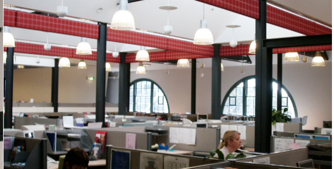
Soundmask transducers blend in with the light fittings