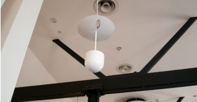
Soundmask transducer and acoustic disc in place