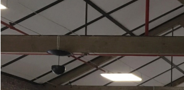
Transducers and acoustic discs blend seamlessly with the decor