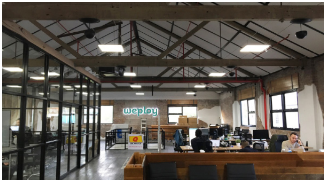
Board room ( left ) adjacent to open plan area without ceiling