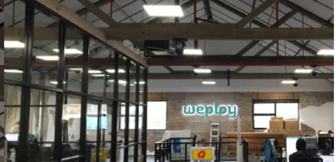
Weploy's warehouse premises have a minimalist style