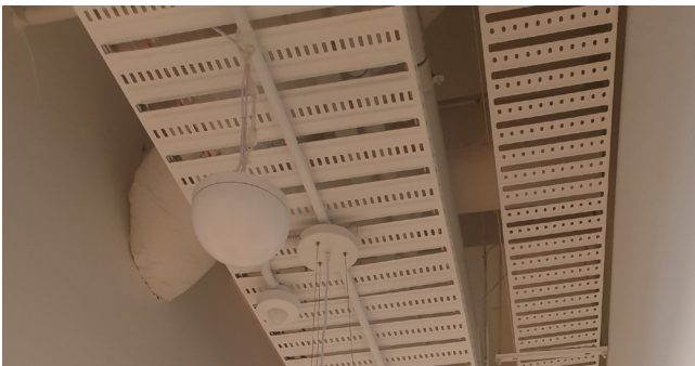
Transducer in communal hallway integrates discretely