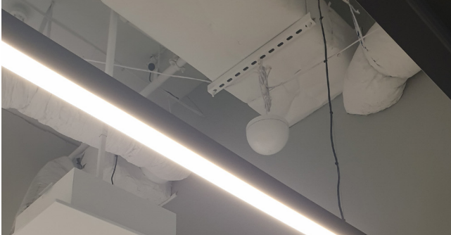
Transducer blends unobtrusively into the open ceiling