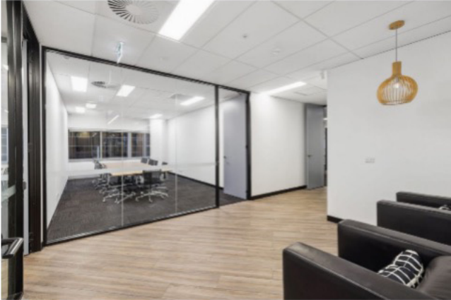
One of the meeting rooms which required speech privacy